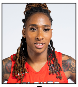
G • 6-0 • 170 @get_em_cb